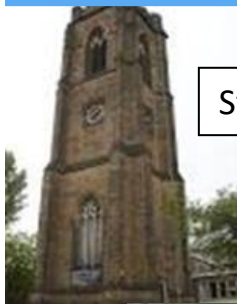
St. Marys Church