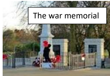
The war memorial