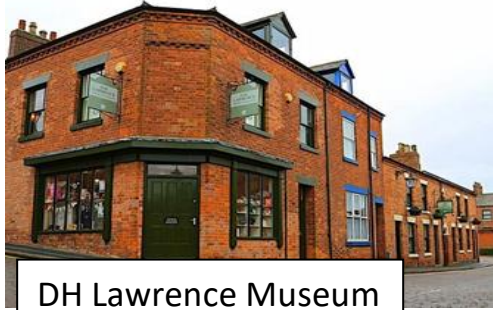
DH Lawrence Museum