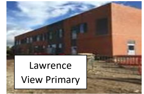
Lawrence View Primary