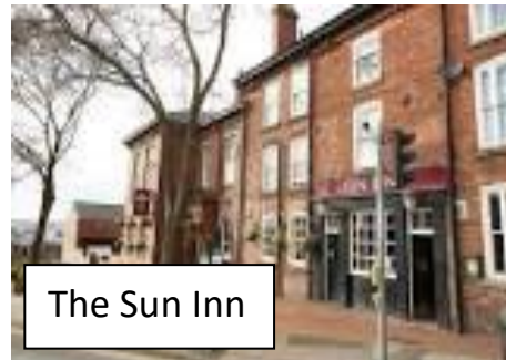
The Sun Inn