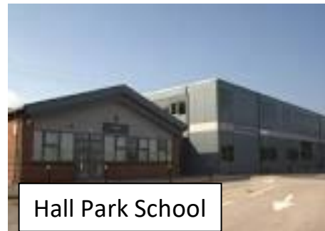
Hall Park School